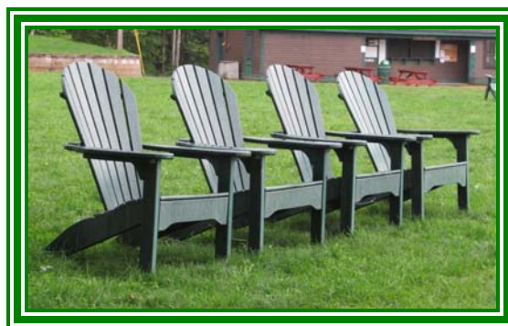
Memorial Adirondack Chairs At Minerva Lake

Thank You For Supporting The Minerva Service Organization